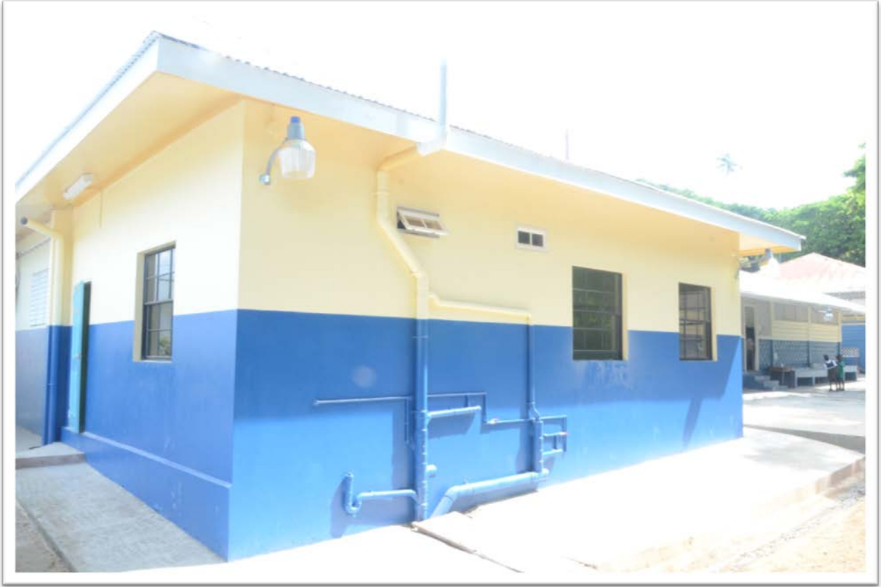
Scarborough Roman Catholic School

55. Designs for the construction of the New Scarborough R.C. School were completed at a cost of $7.5 million.