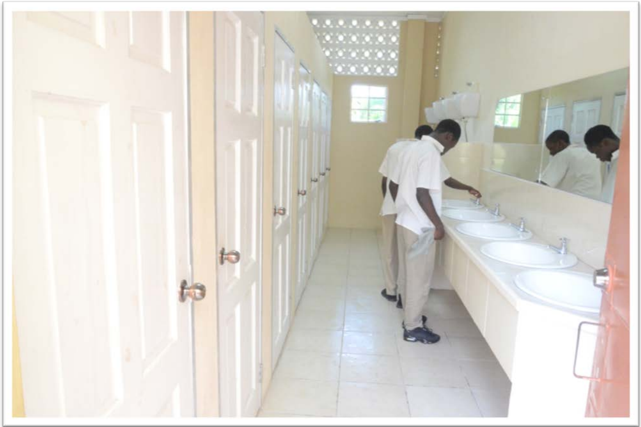
Harmon School of S.D.A

58. Major renovation works were also undertaken at denominational schools in Tobago namely, the Harmon School of Seventh Day Adventist which included plumbing, painting and repairs to the Library, Science Laboratory and Art Laboratory repairs. Minor repairs were also undertaken at Bishop's High School.